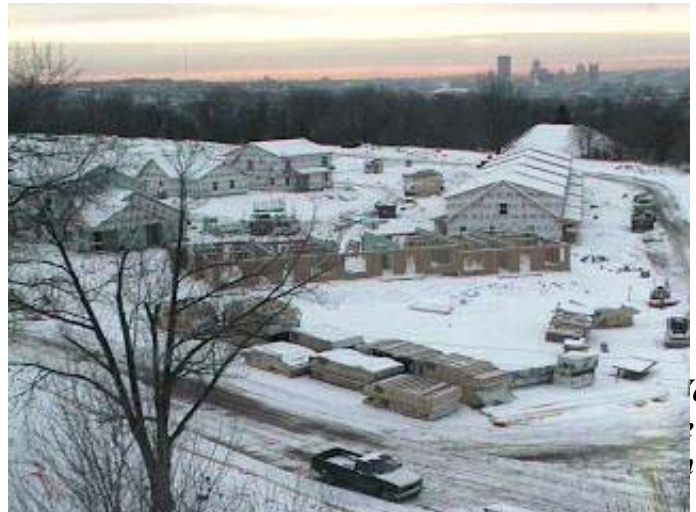
Construction in progress on January 24th. For more pictures on the progress of OVA check out the webcam on our website www.achsng.com .