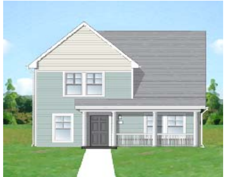
This is what a typical house for sale will look like at the new OVA, Pleasant Ridge.

Workshops are being scheduled to provide detailed information about the homes, discuss assistance programs available, and announce necessary