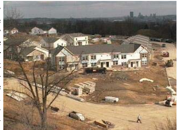
Pleasant Ridge Construction Progress Spring 2005

Whether you have already begun the process of buying a home at Pleasant Ridge or you are newly interested, you can now stop by the Sales Office located at the former OVA site, now called Pleasant Ridge. The office is located on Jefferson Drive, McKees Rocks in the Pleasant Ridge Community Center. Come in and speak to sale representatives about your progress in becoming a home owner . You can also stop in and learn about what steps are needed to become a homeowner at Pleasant Ridge.