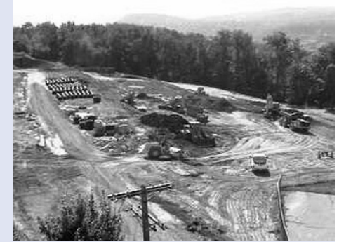
Above: Images of construction activity captured by the new web cam system.