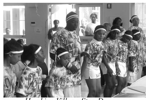
Hawkins Village Step Dancers.